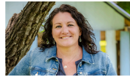
Click the photo for a short video take on the latest in Guatemala.

Welcome to our final newsletter of 2023! This continues to be a very dynamic time for Guatemala and for Maya Health. In Guatemala, the political situation remains challenging, with the future of president-elect Bernardo Arévalo still uncertain. While there are fewer protests and the roadblocks are mostly gone, the people of Guatemala are still pressing the case for the democratically elected president to take office in January. More on that in my video update here .