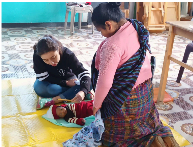
Child development hinges on many factors, including play with adults in the home.