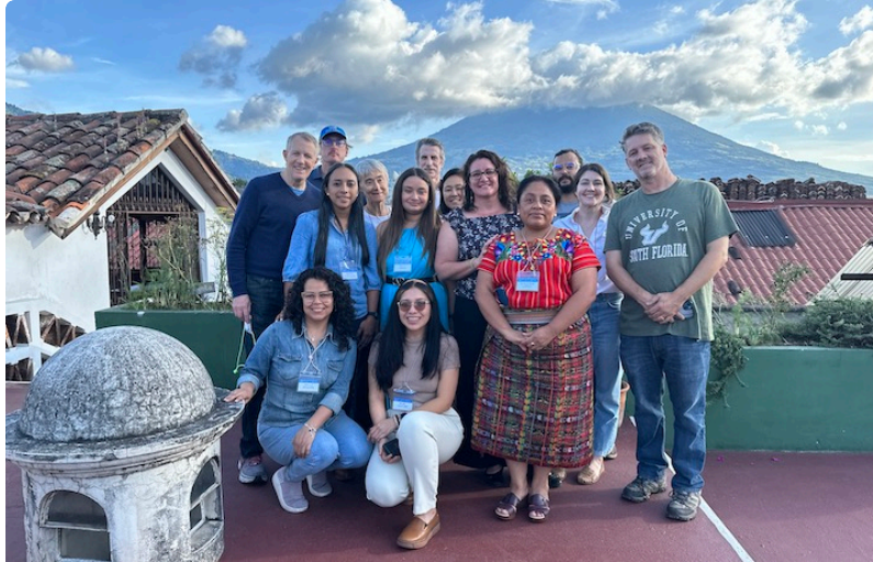
Board and team members enjoy a break during our 2023 retreat.