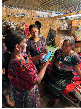
A midwife uses a phone application to monitor progress.

neonatal deaths. Our goal is to work closely with mothers, midwives and communities to gain a better understanding of the issue and how to address it.