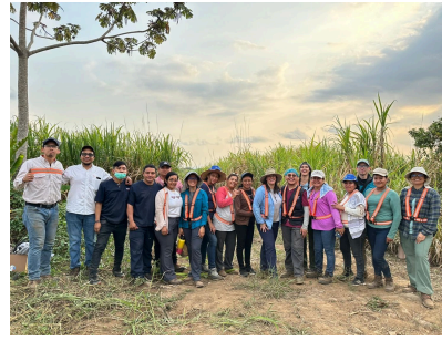
Safe & Healthy Workplaces research team.

The research, conducted in partnership with La Isla Network, is looking at thousands of field and factory workers in Guatemala, El Salvador, Nicaragua, and Honduras.