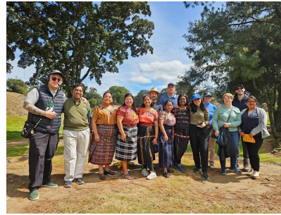
GMCD Research Team

It was a great experience to have members of the far-flung research team (seen in the photo at right) together in Guatemala!