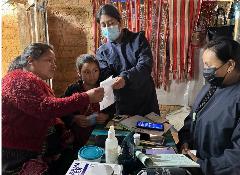
Maya Health nurses provide preventive women's health exams in a patient's home in a Maya Kaqchikel village.

Welcome to our first newsletter of 2024! We have lots to share!