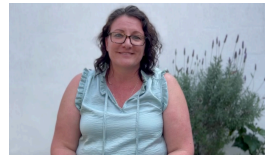
Click the photo for a brief video update.