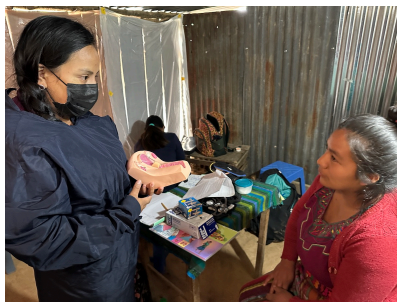
Cervical cancer screening education at a preventive care visit.