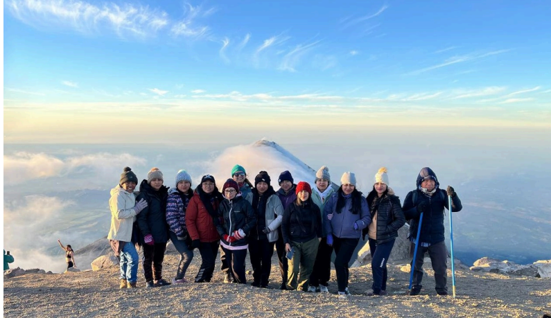
Our intrepid research team proves we're up for any challenge, including taking on Volcán Acatenango!