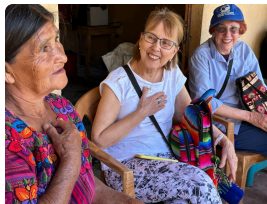
A midwife shares her experiences.